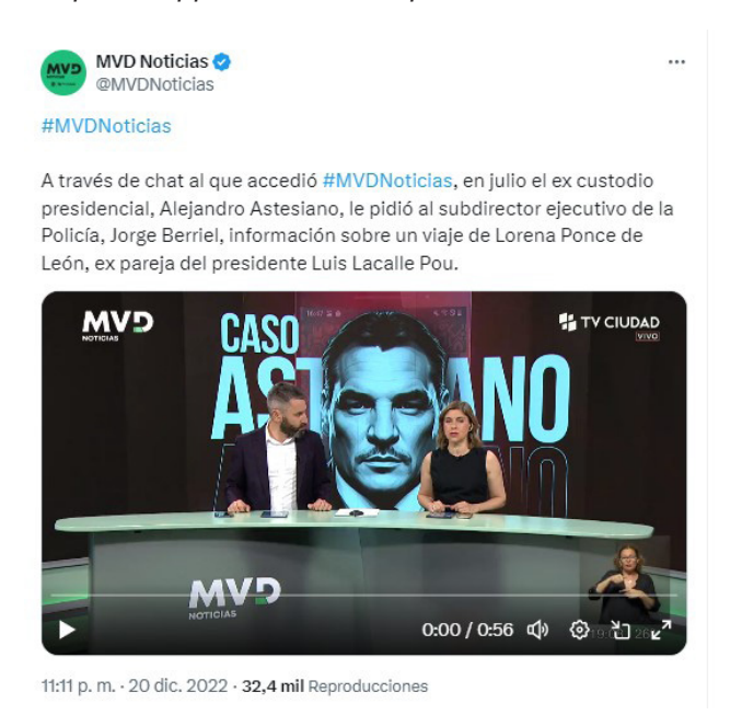
Figure 1 Captures of publications in X from the newscast MVD noticias

Before journalists from El Observador shared the news on their X accounts, M24 radio's news program and MVD Noticias, the primary newscast of Montevideo's public television channel, TV Ciudad, initially reported the information from the mentioned chats. Although the latter program has a live broadcast schedule, given the public transcendence of these events, the production of the program decided to also use X to broadcast more details of the event. Before its live broadcast, the newscast made several publications on this social media, exposing screenshots of WhatsApp conversations, framed in what became publicly known as "the Astesiano case" (MVD,2022).