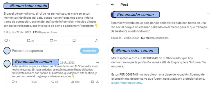
Figure 4 Repercussion on X of the event, by Common Enunciators